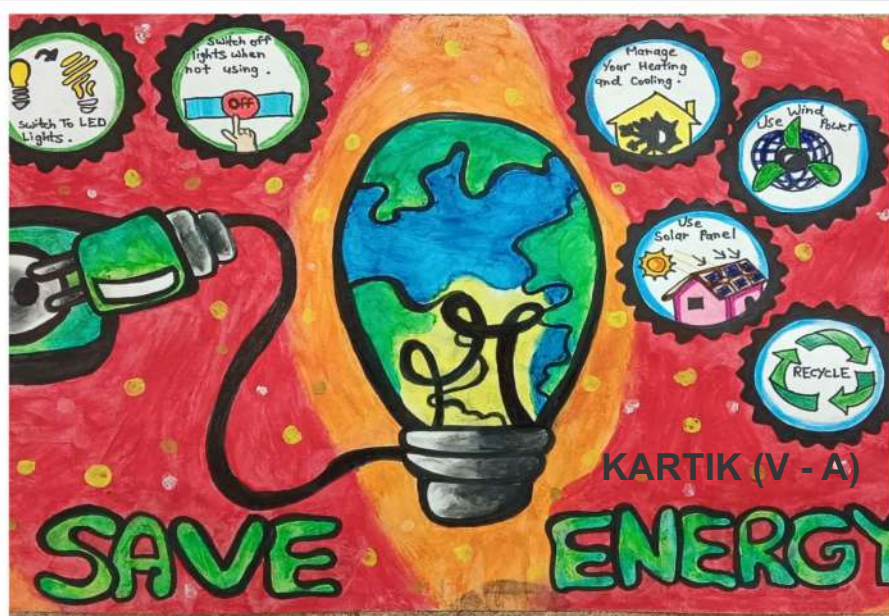
KARTIK (V - A)