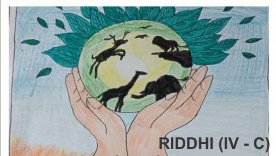
RIDDHI (IV - C)