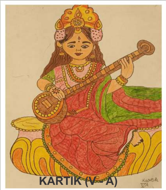
KARTIK (V - A)