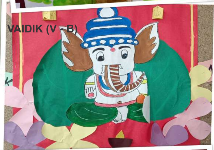
VAIDIK (V - B)