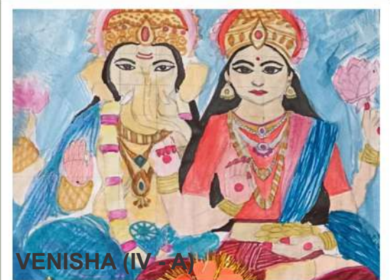
VENISHA (IV - A)