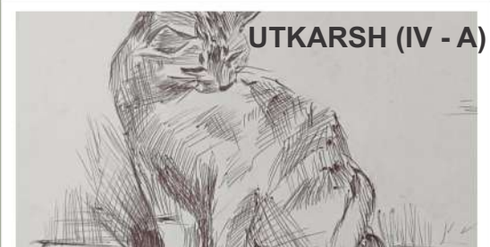
UTKARSH (IV - A)